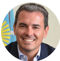
Martín Cerdá Minister of Hydrocarbons Province of Chubut